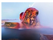
15 Of The Rarest (And Most Mind Blowing) Photographs In History LOLWOT