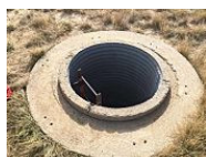
Man Who Explored Empty Silo Wishes He Hadn't HyperTomb