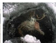
10 of The Creepiest Photographs Ever Taken Time To Break