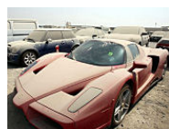
Abandoned Luxury Cars from Dubai Lists and News