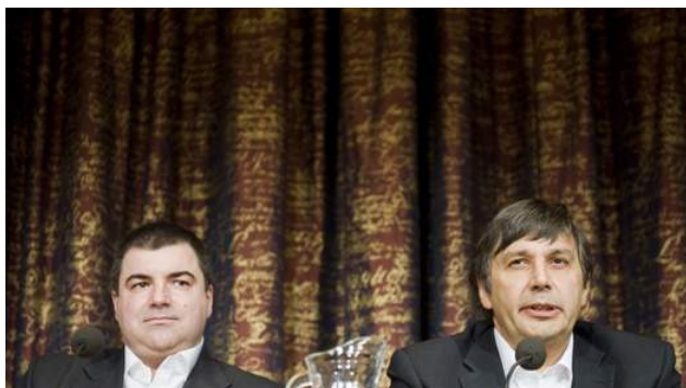
Nobel Prize winners Konstantin Novoselov and Andre Geim

It will be funded with £13m from industry and a £12m Government grant.