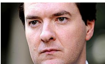
Chancellor George Osborne

Researchers at Cambridge University developing a 'super material' are to receive a £12 million cash boost.