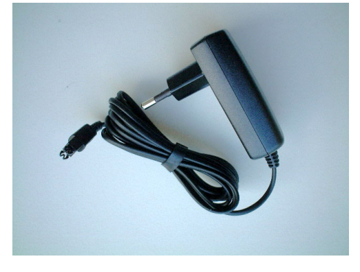
Figure 2: A typical mobile phone charger.

By giving a real-world example the generic question is given engineering context